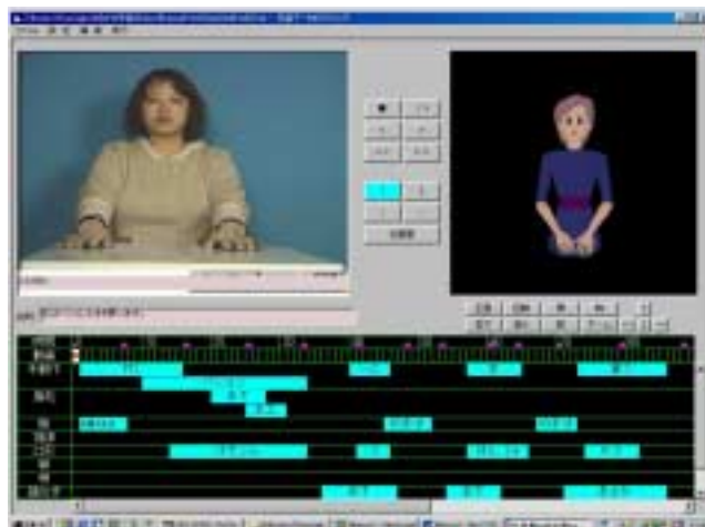
Figure 5.1 Sign-language annotation tool

Video files were reviewed and annotated by native signers and interpreters. Linguistic tags were synchronized with video frames after the annotation.